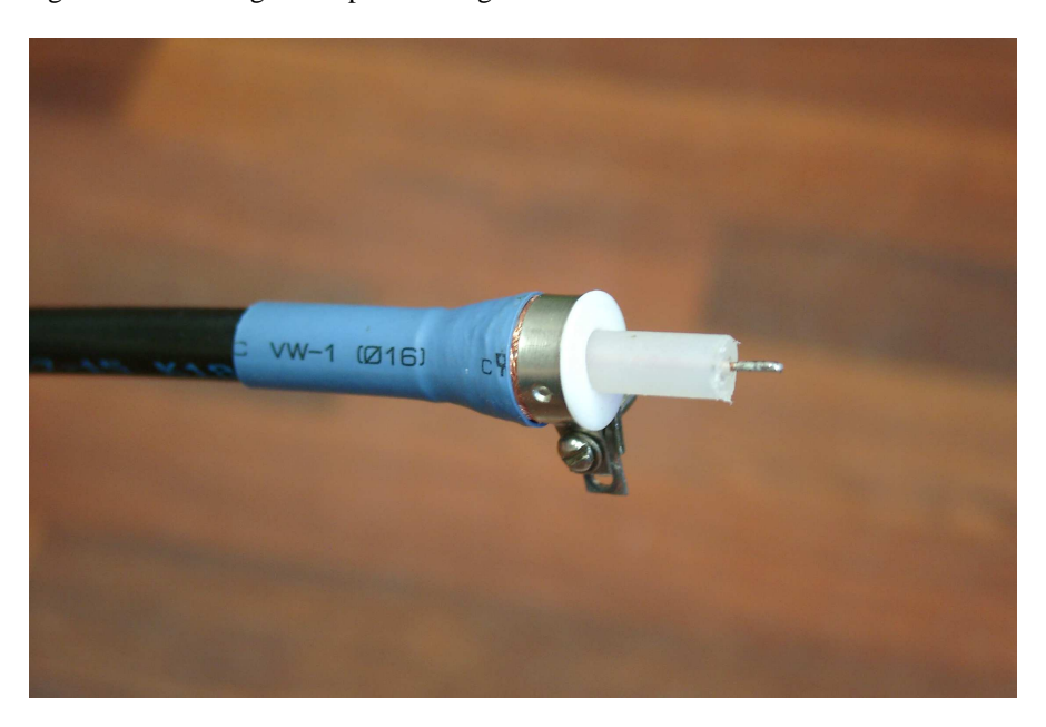
Fig.2. The cone teflon insulator at the cable end.

Connect the other side of coaxial cable to the load. The cone teflon insulator is used at the cable end to prevent the discharge between central cable wire and the cable braid (See Fig.2). You may use additional wires for connection: solder the high voltage signal wire to the central cable wire and screw/solder ground signal wire to the ground clamp. It is recommended to use as short additional wires as possible. More than 10 cm wires result is excessive stray inductance and significant reducing of the pulse voltage on the load.