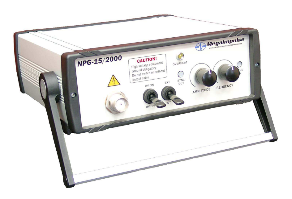
Fig.1. General view of NPG-15/2000(N) nanosecond pulse generator.