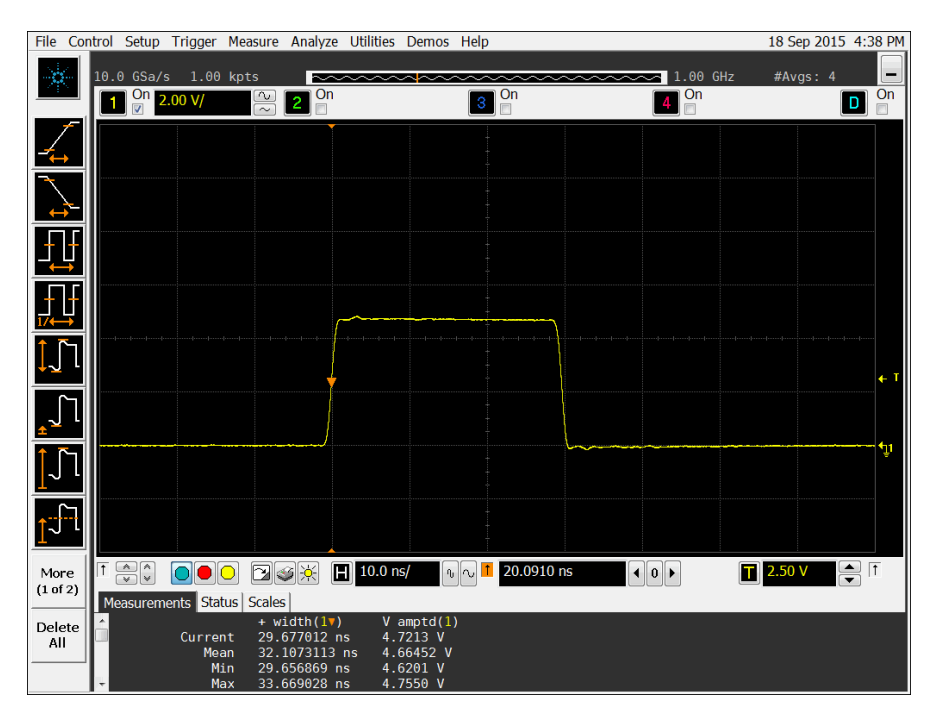
Fig. 3. Recommended triggering pulse waveform.

The recommended triggering pulse waveform is shown in Fig. 3. The nominal triggering pulse amplitude is +5V at 50 Ohm, the pulse duration is 30 ns, and the rise time is 1 ns. A longer rise time may result in increased output pulse jitter.