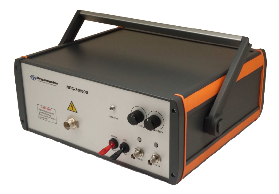
Fig.1. General view of NPG-30/500 nanosecond pulse generator.