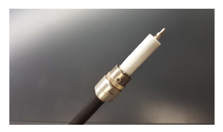
Fig.2. High voltage output cable connector of NPG-30/500.

It should be completely wet by oil, but excessive oil is not needed. Please see Fig.2.