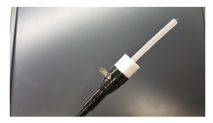
Fig.3. The cone teflon insulator at the cable end.