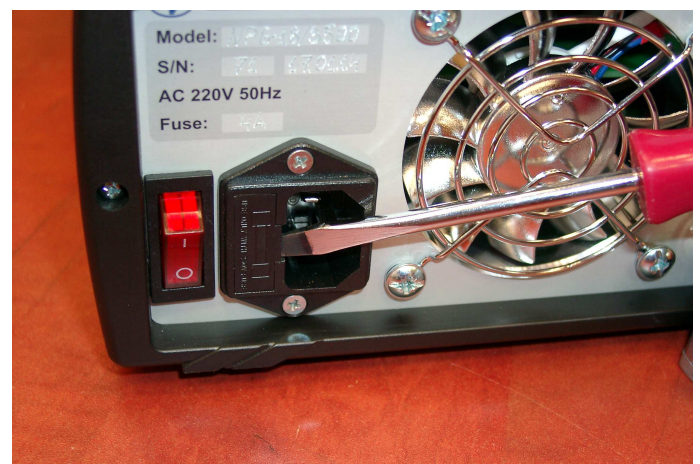
Fig.4. Removing of the fuse holder by flat screwdriver.

The fuse holder is located in three terminal power supply connector. Please use flat screwdriver or other suitable tool to remove the fuse holder (see Fig.4.).