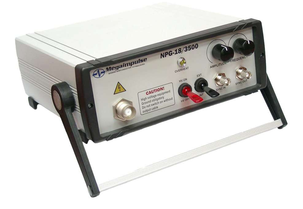
Fig.1. General view of NPG-18/3500(N) nanosecond pulse generator.