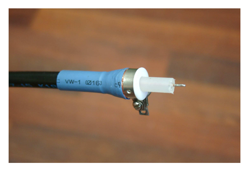
Fig.2. The cone teflon insulator at the cable end.

➔ More than 10 cm additional wires between the load and coaxial cable result in excessive stray inductance and significant reducing of the pulse voltage on the load.