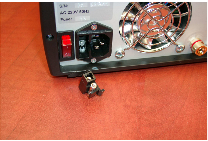
Fig.5. Two fuses in fuse holder including one spare (upper in the figure).

There are two fuses in the fuse holder including one spare fuse (see Fig.5).