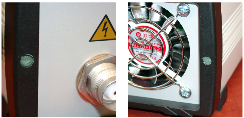
Fig.6. Warranty seals on the front and real panels.

Removing of the warranty seals terminates the warranty.